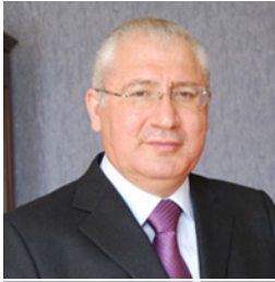
Heydar Asadov Minister of Agriculture of the Republic of Azerbaijan